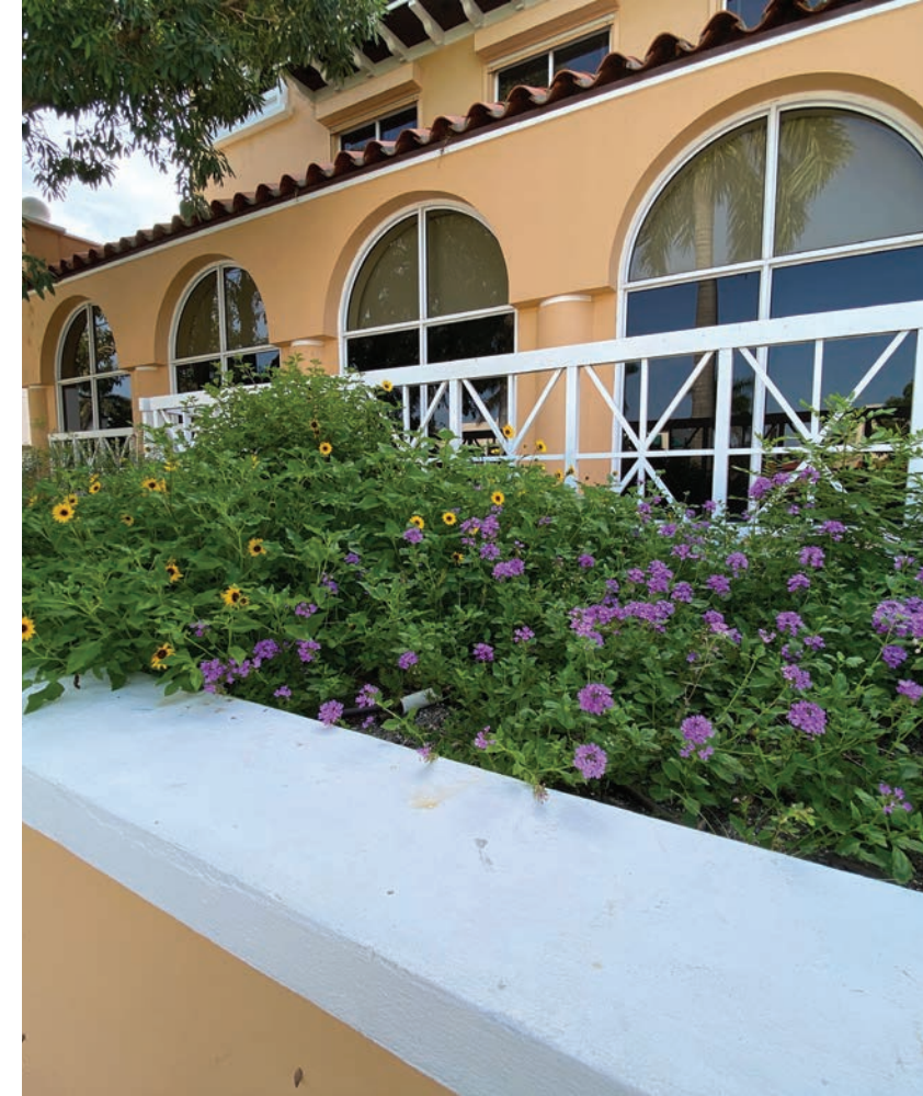
Police Station after.