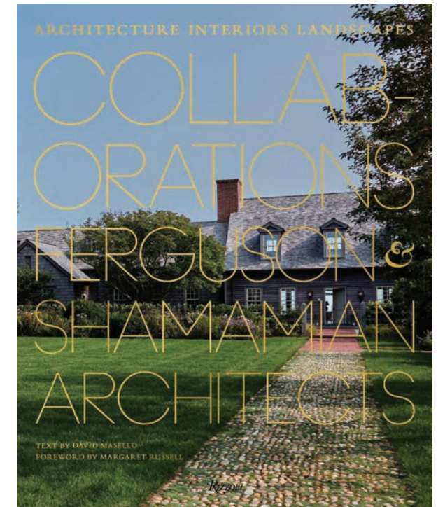
Architects Ferguson & Shamamian new book will be featured during their lecture.