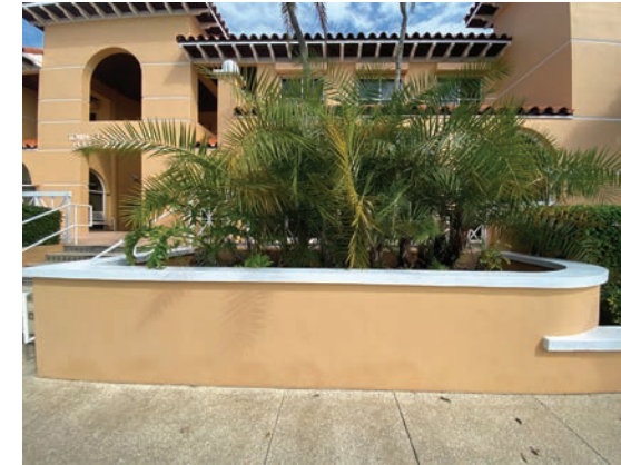
Police Station before.

While many communities in South Florida require new landscapes to include a greater percentage of native plants, Palm Beach's ordinance is an important step in acknowledging the impact our landscape choices have on the environment.