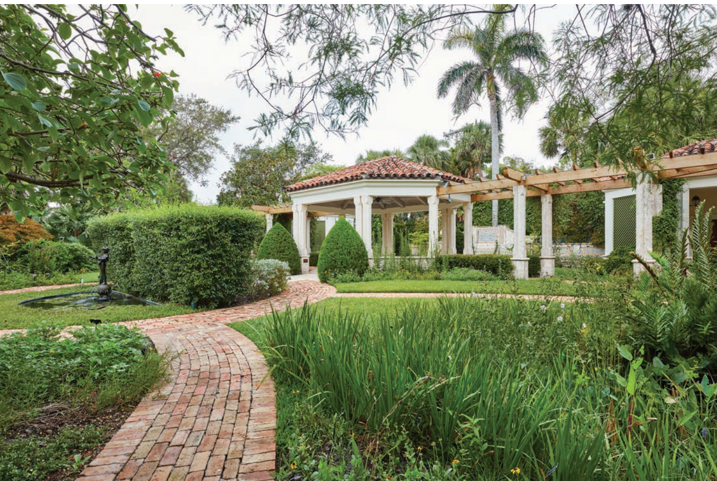
Pan's Garden is a living library of native plants.