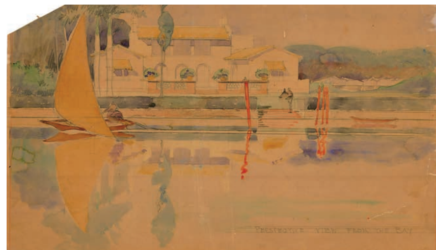
Watercolor by Marion Sims Wyeth to be featured in MSW: Architect & Artist .