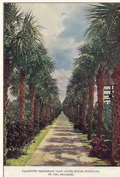
PALMETTO PROMENADE FROM HOTEL ROYAL POINCIANA TO THE BREAKERS