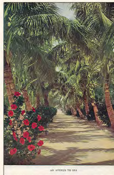
AN AVENUE TO SEA