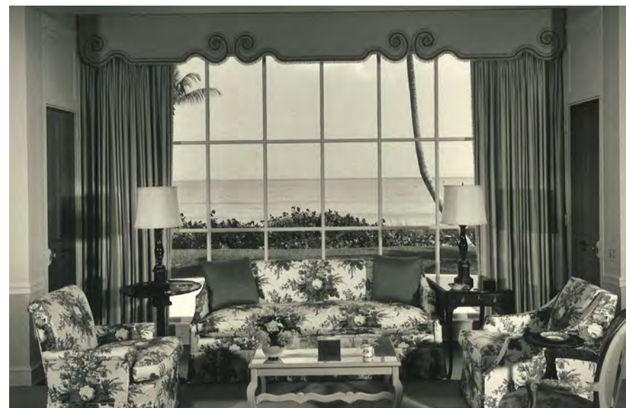
A Jessup Interior at a home in Hobe Sound.