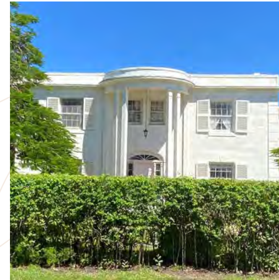
The new law applies to the recently landmarked home on Crescent Drive.