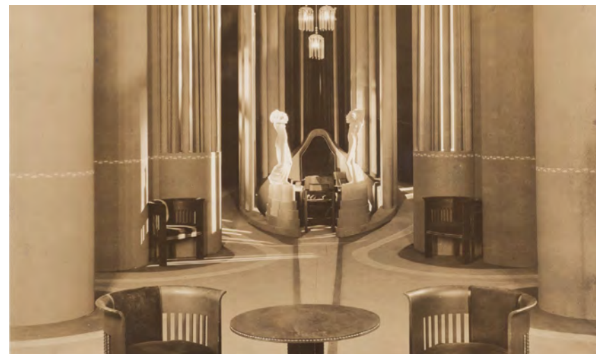
Set Design by Joseph Urban

They all arrived in Palm Beach at an opportune time that coincided with commissions that allowed them to build what previously could only be imagined. Clients from a variety of backgrounds: art, aeronautical engineering, and even federal administration put their faith in the architects to visualize their Moderne dream homes.