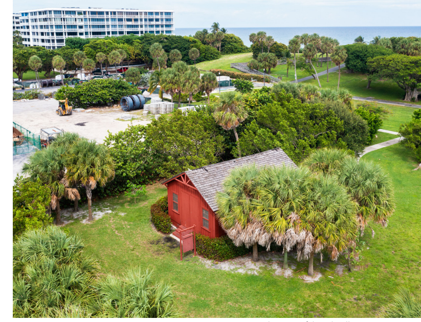
Current location of the schoolhouse.