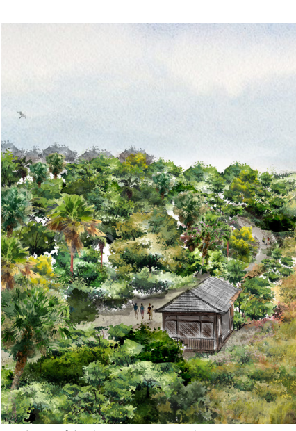
Rendering of the dune restoration and pathways.