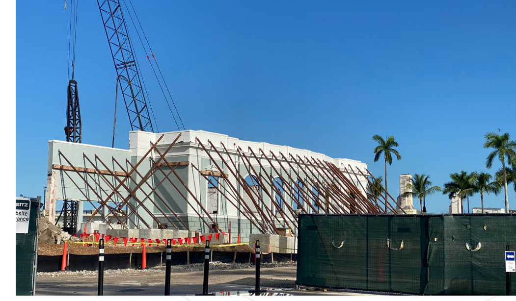
Demolition of the Historic Playhouse.