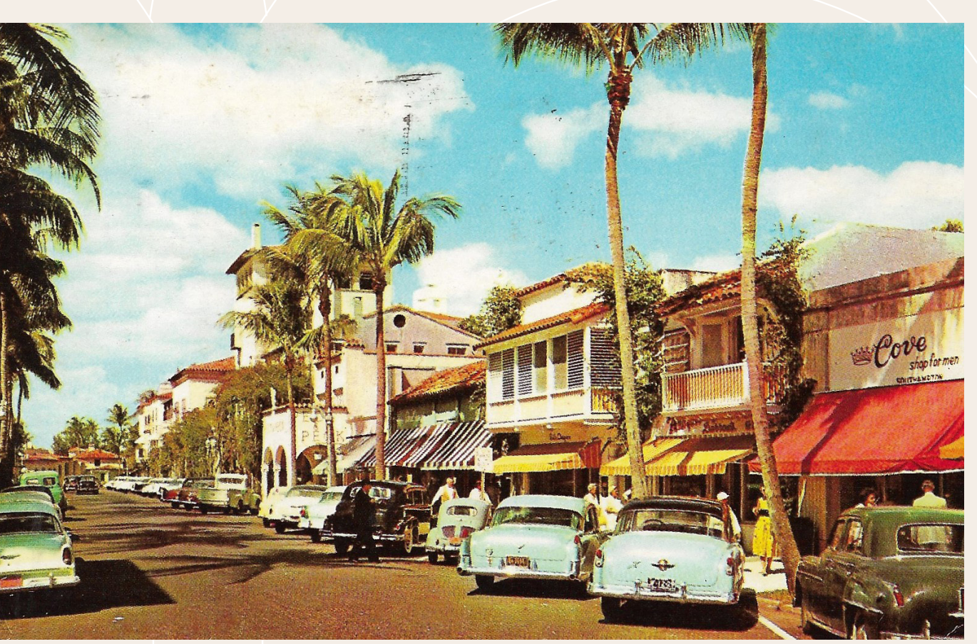
Worth Avenue circa 1960s.

For more information, visit: www.worth-avenue.com/worth-avenue-historic-walking-tour/