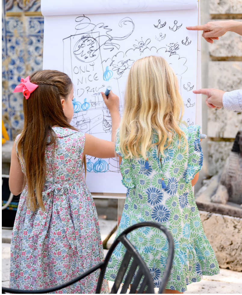
Children participating in the drawing workshop.