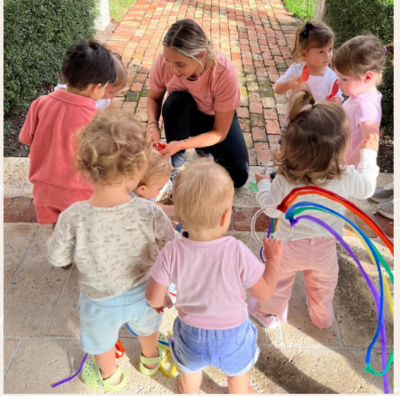
ZenHippo in the Garden.