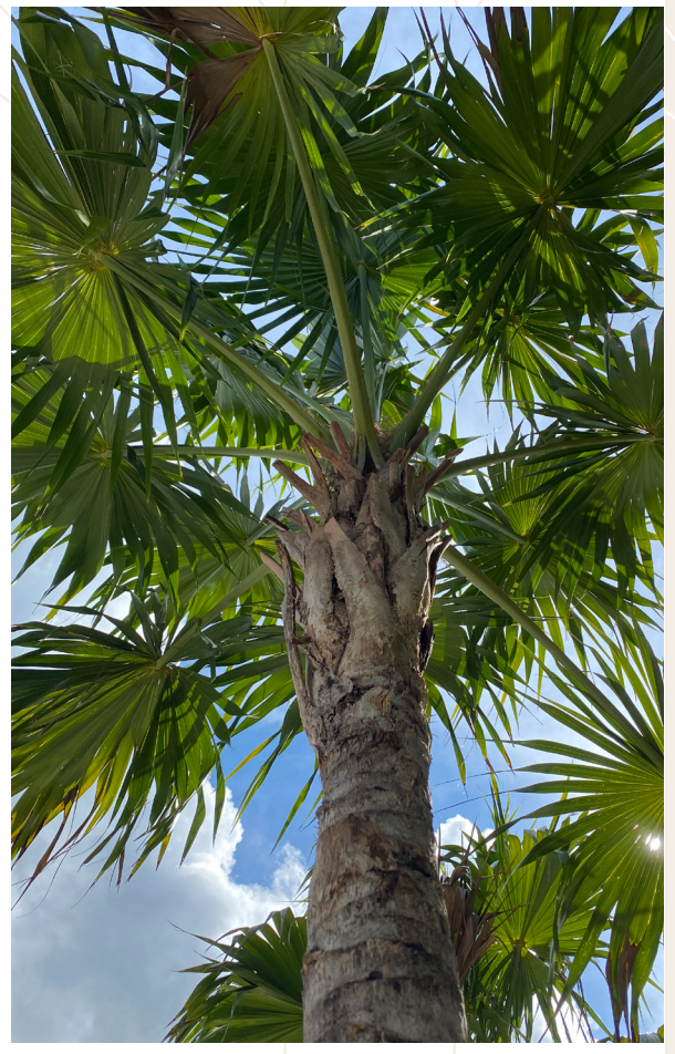
View of the Tatch Palm from underneath

Using Twinflower and Fogfruit rather than sod under the palms maximizes the ecological impact of the garden's footprint and is in alignment with the garden's mission to protect and celebrate Florida's indigenous plants and the wildlife they support. Already bees and butterflies are visiting the new plantings! This was a summer of many changes— I invite you to please visit and see them all!