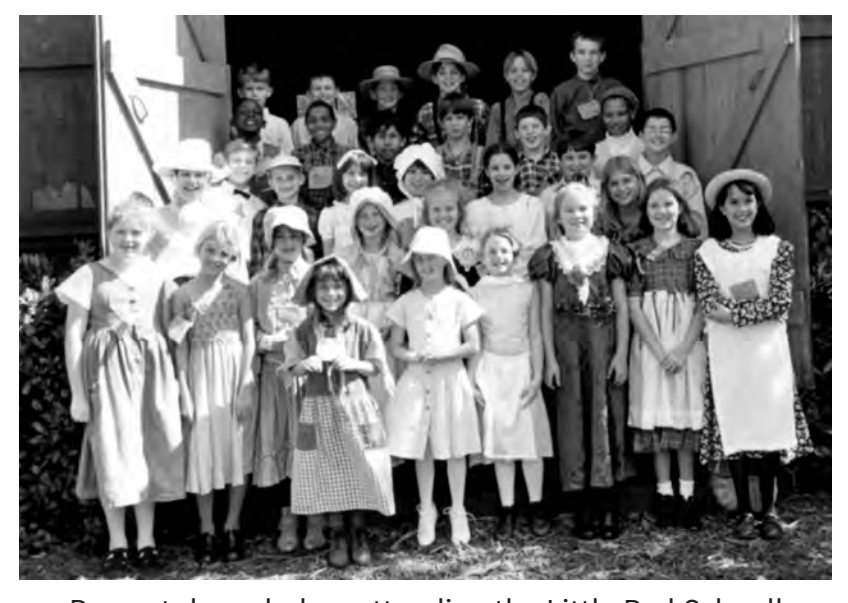
Present day scholars attending the Little Red Schoolhouse