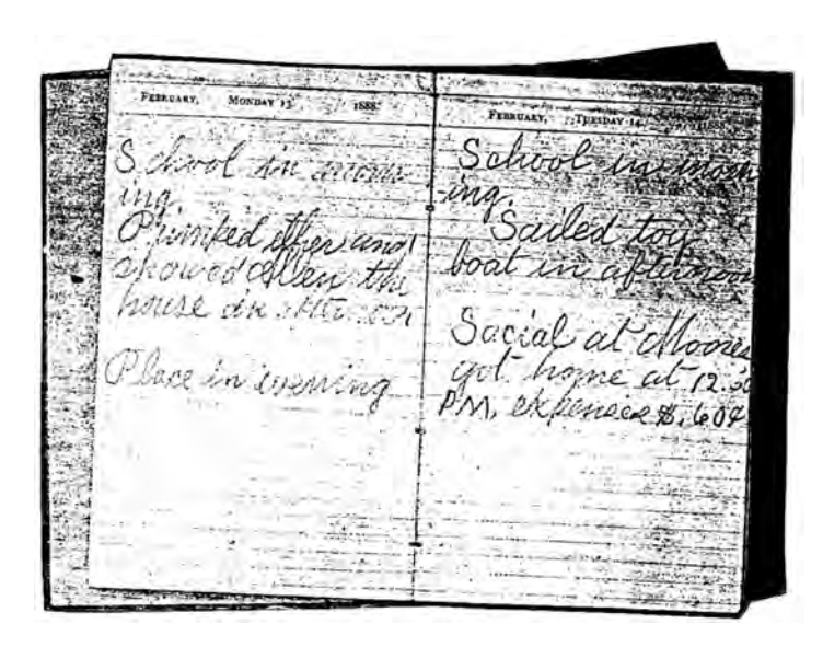
COPY OF WILL McCORMICK'S DIARY