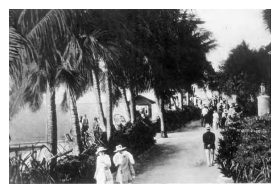
The Lake Trail in Palm Beach, early 1900s.