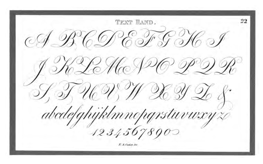
Spencerian Script was the order of the day but the old penmanship books such as Copley's Plain and Ornamental Standards Alphabet , 1870, illustrate other acceptable styles.