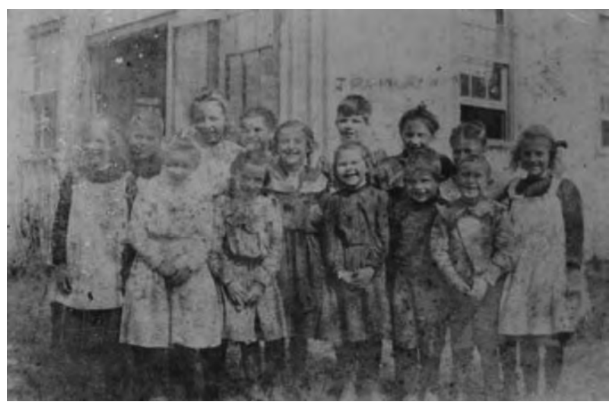
Early scholars attending the Little Red Schoolhouse

Jewelry Watches Make-up Nail polish High-heeled shoes Kleenex Caps with advertising Loud and wild Shirts with advertising prints Toys