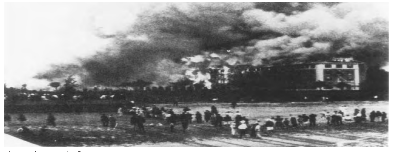
The Breakers Hotel II fire