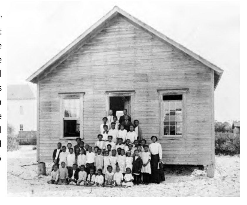
Photo of Lake Academy, 1896

6 and 21 but no black school. The first school for black children was established in 1893. Classes were held in the Mt. Olive Baptist Church, later known as the Tabernacle Missionary Baptist Church, located in the "Styx" in Palm Beach. The church later moved to West Palm Beach. Mr. J. E. Jones was appointed the first teacher. Around 1896 a schoolhouse was built at Tamarind Avenue and Datura Street in West Palm Beach and called Lake Academy. Children attended this school until 1917, and then moved into the new Industrial School.