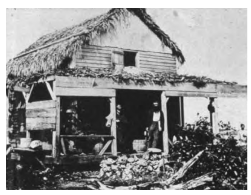
Photo of Hannibal D. Pierce

Hannibal D. Pierce built this home for his family on Hypoluxo Island in the 1870s. Though it looks primitive, it was typical of the homes of the day, made from salvaged lumber and local materials. The roof was made of palmetto fronds and while it does not appear to be substantial, the diary of Charlie Pierce states it did not leak: "The ocean beach was combed for timber to make the house frame...the timbers had to be hauled over the beach ridge to the lake and then rafted across to the homestead...shingles were not shipped on sailing vessels at that time...so... palmetto fans made a good roof but had to be replaced every two or three years. It was a cool dry and dry house, but there were others others who liked the palmetto leaves also. Roaches, lizards, and small snakes all made their homes in them..." Pioneer Life in Southeast Florida by Charles W. Pierce.